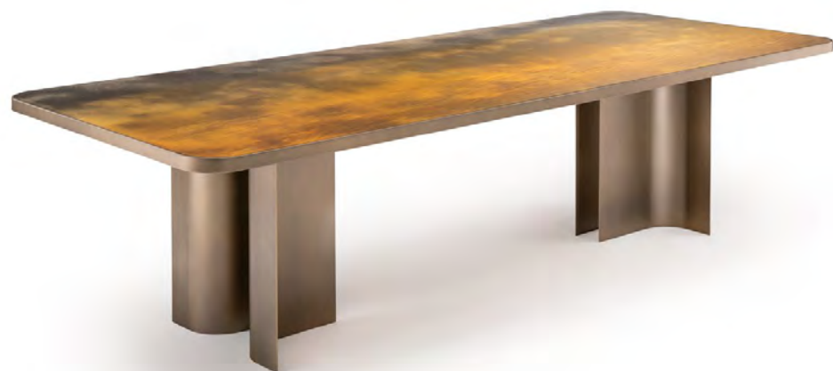
Lamis Table / W 300 cm, D 120 cm, H 76 cm metal structure finished in burnished brass, glass top decorated with Gargano finish