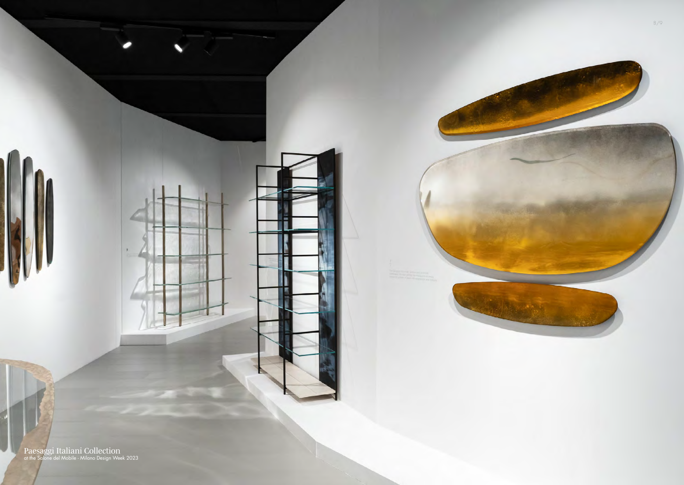
Paesaggi Italiani Collection at the Salone del Mobile - Milano Design Week 2023